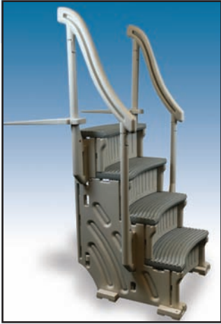
Above Ground Stair Case