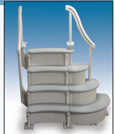
Above Ground Curve System