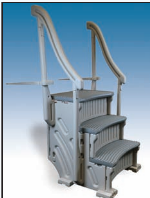
In-Ground Stair Case