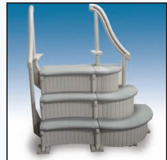
In-Ground Curve System